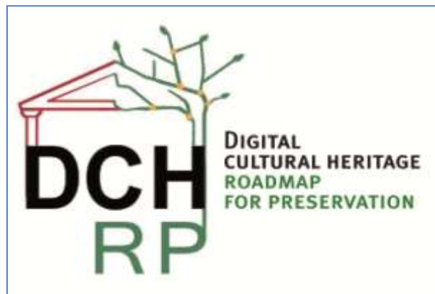
Fig. 1 DCH-RP Logo

The DCH-RP logo is made showing both the acronym of the project and the explicative text. It reminds the ancient architectural elements of DC-NET logo, as symbols of the cultural heritage sector and the network connections of digital infrastructure, to underline the connections linking the two projects.