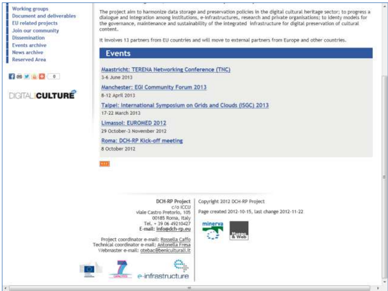
Fig.3 Home page (bottom)